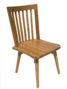
yǐ zi 椅子