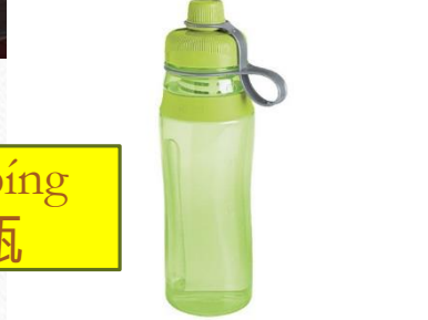
Shuǐ píng 水瓶