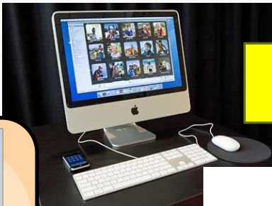
Diàn nǎo 电脑