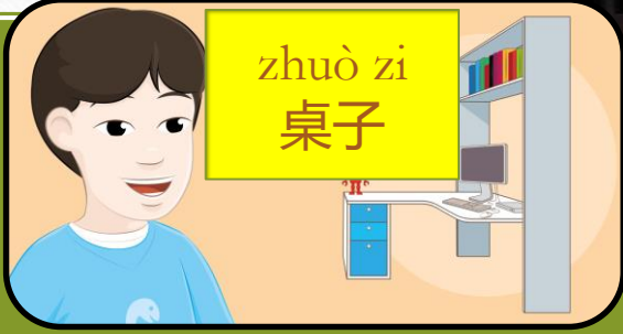
zhuò zi 桌子